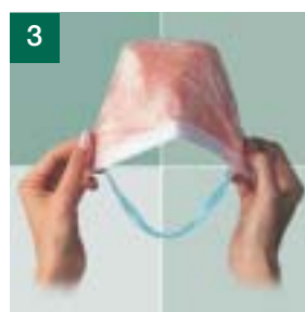
3 Hold mask upside down to expose the two headbands