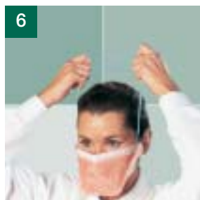
6 Bring the headbands over the head