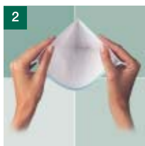
2 Gently pre-bend nosepiece to conform mask to face