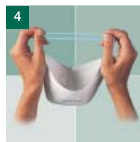
4 Separate the headbands with index fingers