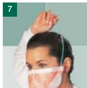
7 Place the first headband at neck, Pull the remaining headband up and place at crown