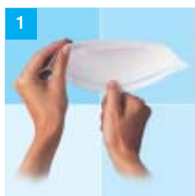
1 Separate mask to open fully

Forcefully inhale and exhale several times. The respirator should collapse slightly when you inhale and expand when you exhale. You should not feel any air leaking between your face and the respirator. If the respirator does not collapse and expand OR if air is leaking out between your face and the respirator, then you have NOT achieved a good facial fit. Adjust the respirator until the leakage is corrected and you are able to successfully Fit Check your respirator.