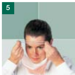
5 Cup the mask under chin (orange side out)