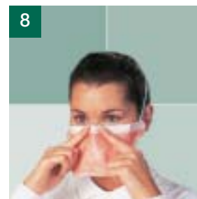
8 Form nosepiece tightly across bridge of nose and face. Adjust mask to achieve facial seal

Do not proceed with your activities until you have checked your respirator successfully.